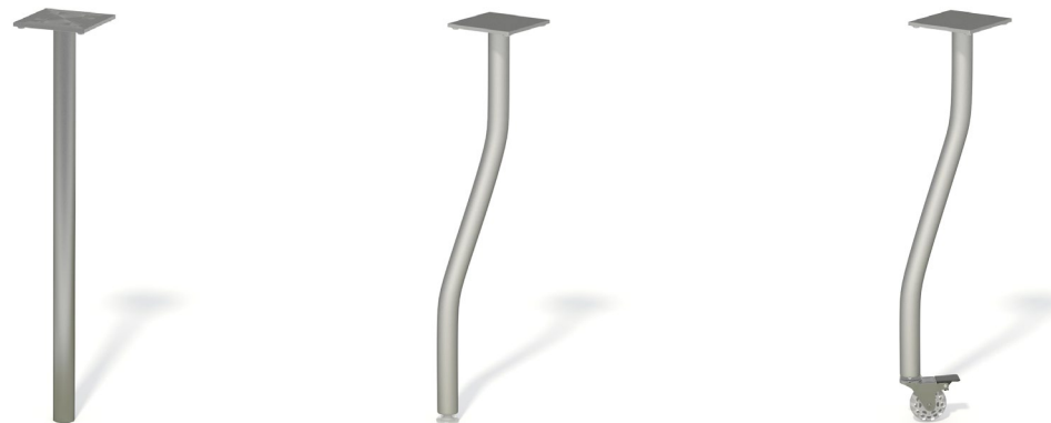
Straight Wave Wave Caster