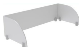
Surround Frosted Acrylic Screen