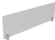
Frosted Acrylic Screen