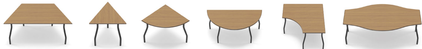
Trapezodial Triangle Quarter Half Round Corner Workstation Barrel