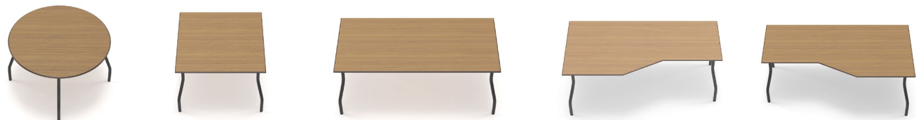
Round Square Rectangle Puzzle Left Puzzle Right